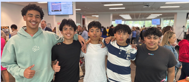
Lewis students lead learning at a division-wide conference for FCPS teachers and leaders focused on Portrait of a Graduate