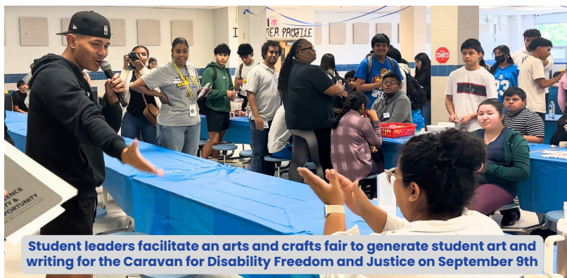
Student leaders facilitate an arts and crafts fair to generate student art and writing for the Caravan for Disability Freedom and Justice on September 9th

Here is some of what our students said about their experience in the Lewis Leadership Program this year: