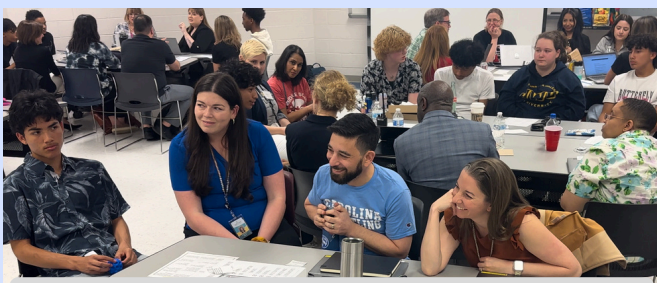
Lewis Leadership Program students work as youth consultants for leadership teams from eight schools and central office at the division-wide Learning Model Community of Practice