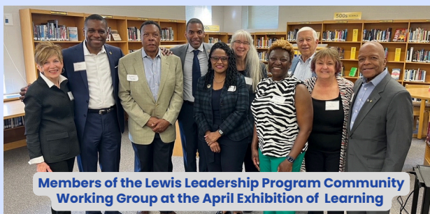
Members of the Lewis Leadership Program Community Working Group at the April Exhibition of Learning