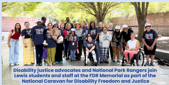
Disability justice advocates and National Park Rangers join Lewis students and staff at the FDR Memorial as part of the National Caravan for Disability Freedom and Justice

It may seem counterintuitive, but adults play a crucial role in fostering youth agency. All Lewis Leadership Program community action projects are led by students and grounded in their ideas about our community's strengths and needs. But successful student-led projects are energized and amplified by the efforts of adult thought partners and supporters. Our fall 2024 community action projects positively impacted the world beyond Springfield because of our partners. In December, we kick off our winter student-led projects and invite any interested, youth-centered adult to join us!