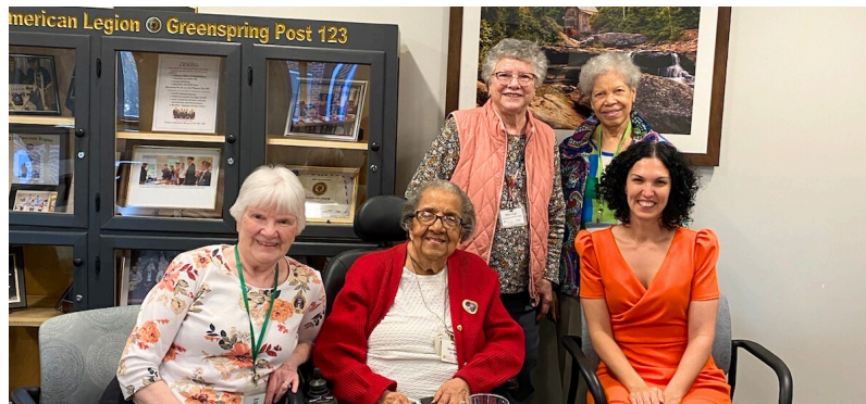
Greenspring Senior Living Community's Black and White Shared History group supported Lewis students at our fall Exhibition of Learning, and have begun exploring opportunities for a collaborative service project.