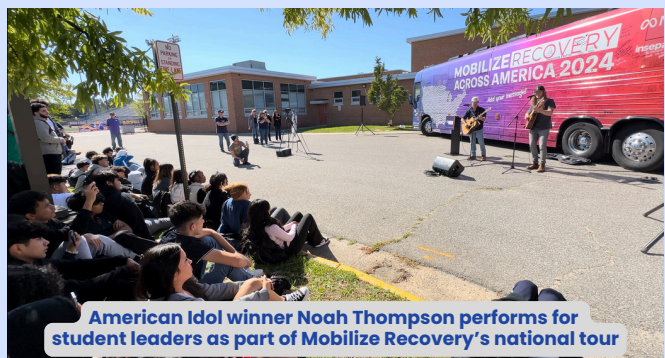
American Idol winner Noah Thompson performs for student leaders as part of Mobilize Recovery's national tour