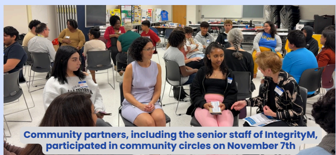
Community partners, including the senior staff of IntegrityM, participated in community circles on November 7th